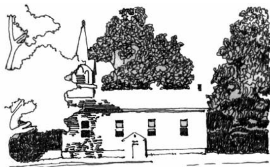
(Top) Schoolhouse: Denmark, Ashtabula County. (Bottom) Methodist Church: Kelloggsville, Ashtabula County.